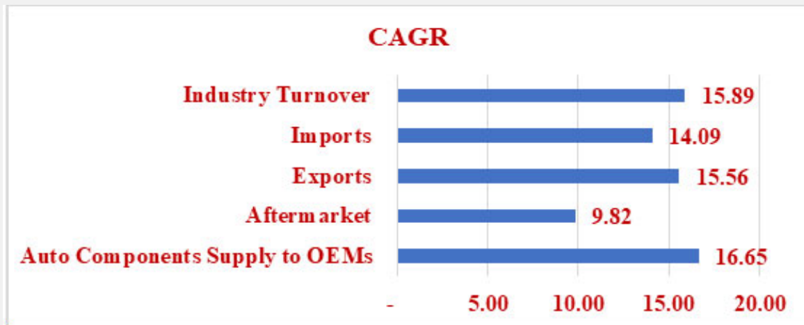
Figure 1: CAGR

The Compound Annual Growth Rate (CAGR) was calculated for each segment is given in figure 1: